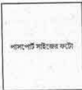
পাসপোর্ট সাইজের ফটো