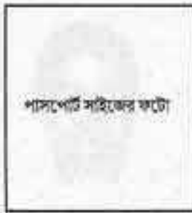
পাসপোর্ট সাইজের ফটো

দলিল দাখিলকারক/দাতা/দাতাগণের/গ্রহীতা/ গ্রহীতাগণের ফটো ও দশ আঙ্গুলের টিপ ছাপ :