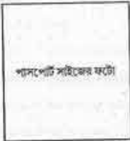
পাসপোর্ট সাইজের ফটো